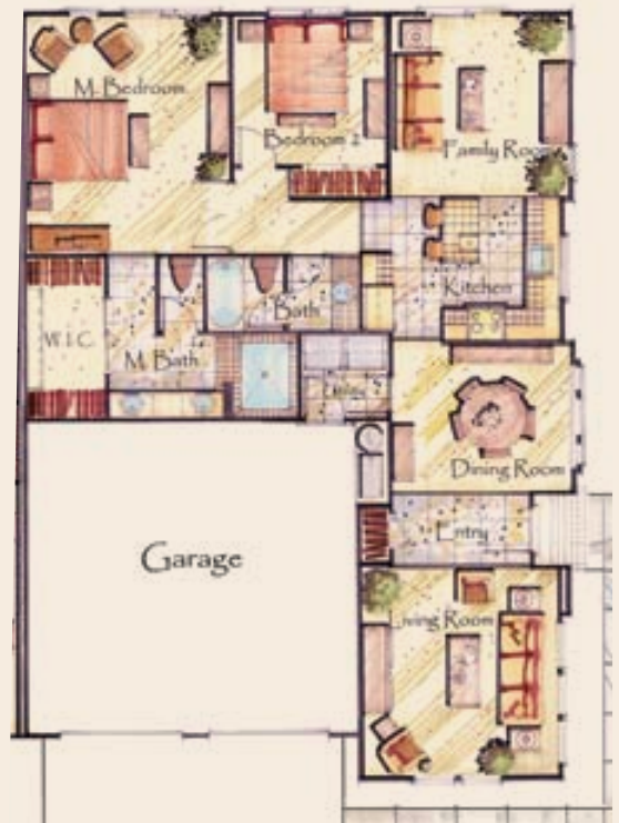
Optional Tuscana Main Level Floor Plan ▲

Pictures shown are artist's rendering. Actual floor plans and features many vary.