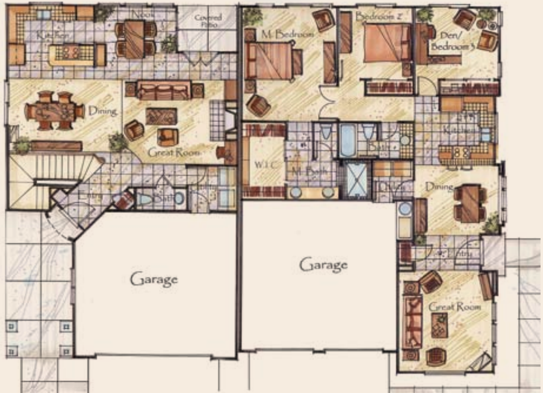
Ferrara Main Level Floor Plan ▲