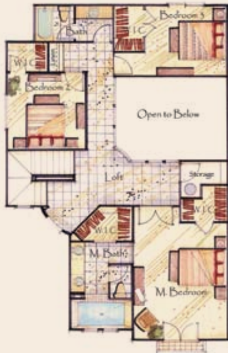
Ferrara Upper Level Floor Plan ▲